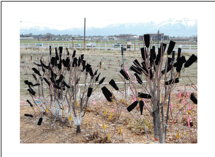
Figure 1. Terminals of pruned shoots covered with velour bags to etiolate new growth.

Five selections of bigtooth maple (USU-ACGR-1001, 1002, 1003, 1004, and 1005), grafted onto seedling rootstocks of the same species and grown in a coppiced nursery environment were used. In late January 2009, trees were prepared for etiolation by pruning just below the third node from the base and leaving a stub above the second node. At bud swell, black velour drawstring bags with open ends were placed over the terminals of randomly selected shoots and tied off just below the second node (Fig. 1). When approximately two sets of fully expanded leaves had emerged from the bag, cuttings were harvested by removing the parent shoot above the first node (Fig. 2). Cuttings were prepared for sticking by removing the bags, cutting at the base of the current season's growth, removing the terminal above the