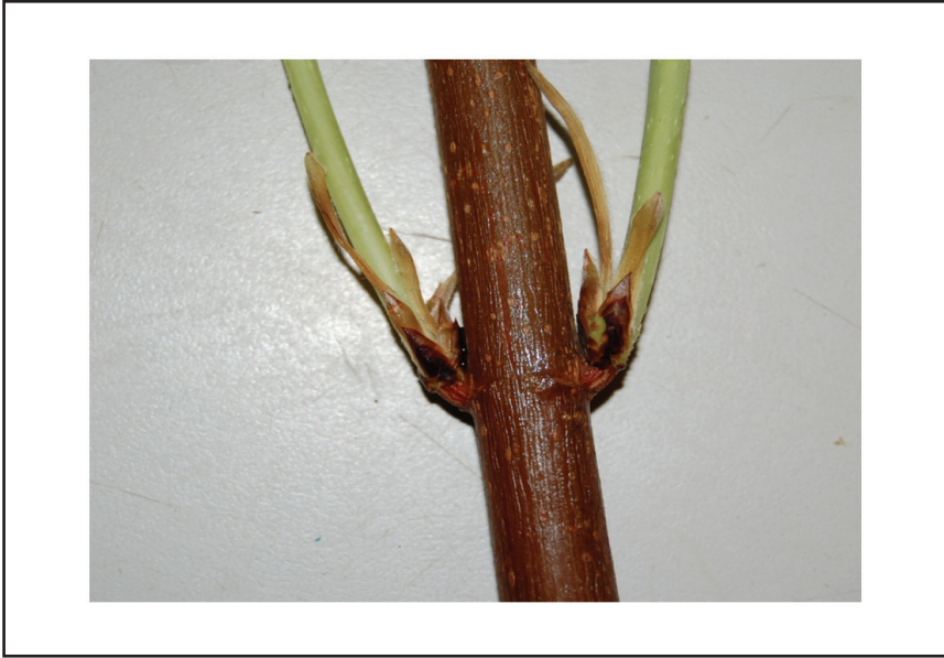
Figure 2. Etiolated stem bases after removal of velour bags.

second node, wounding by scraping off one cm of bark down to the xylem on two sides, and then dipping in 4000 ppm IBA as Dip'N Grow® (1.0% IBA, 0.5% NAA as 20 mL Dip'N Grow in 30 mL 50% ethanol) for five sec. Cuttings were stuck in 3 1/2 in. × 5 in. pots with premoistened media of perlite and peat (3 : 1, v/v) and then placed under shade cloth and mist (7 sec/12 min) with bottom heat at 25–26 °C.