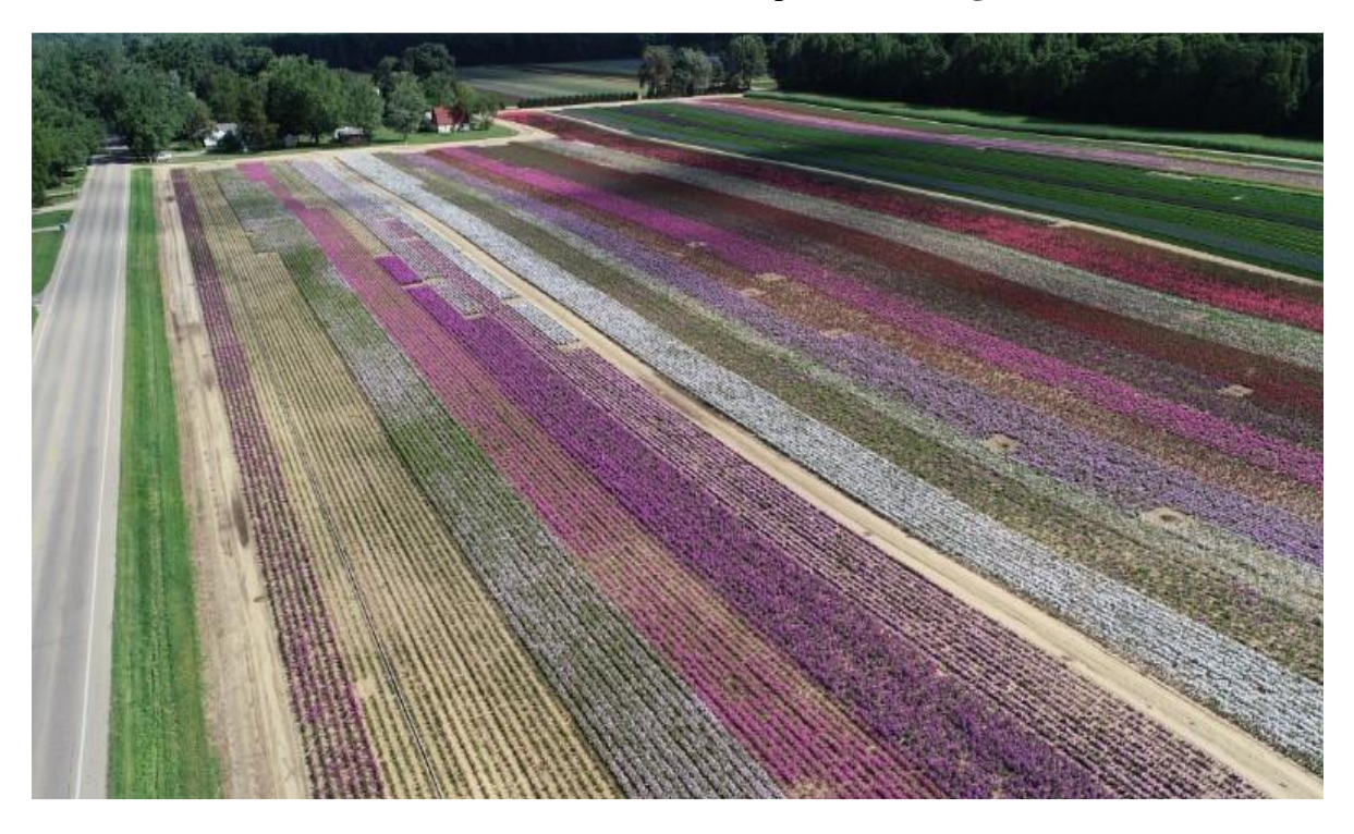
Figure 1. Field production herbaceous perennials at Walters Gardens

Of our 1500+ acres of field space, about 1200 is actively farmed. We rotate crops to rebuild our soils, so in any given year we typically have just under 400 acres planted in perennials ( Fig. 1 ).