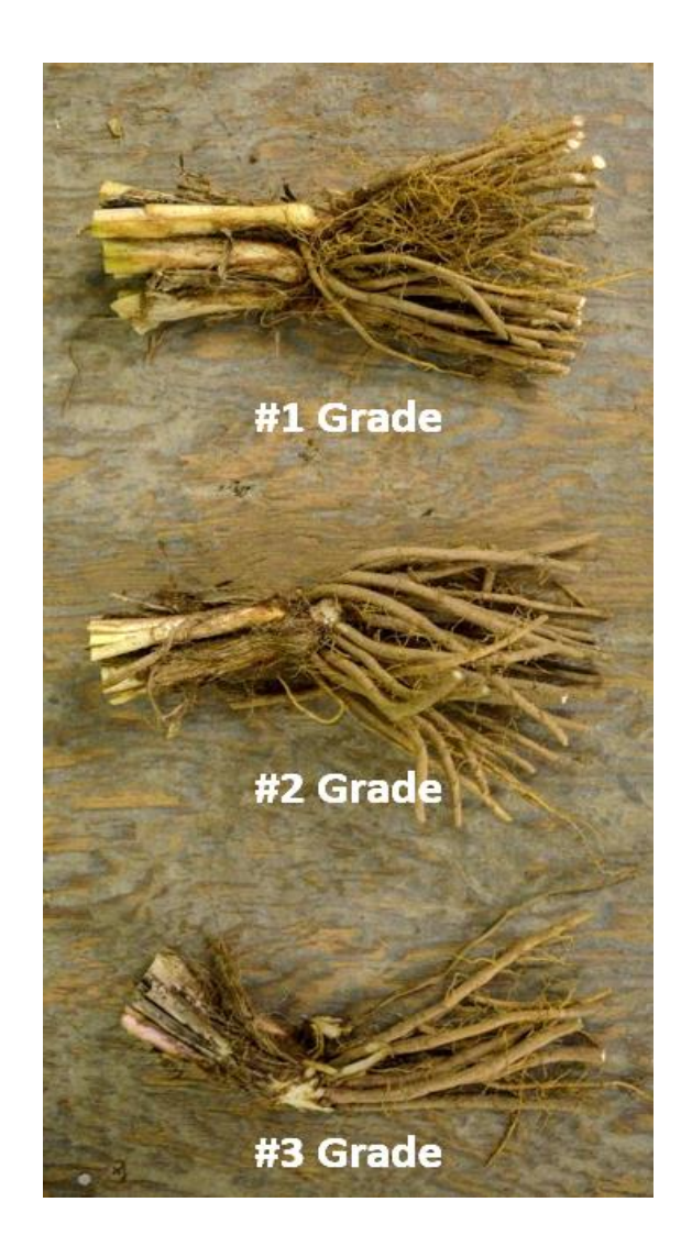
Figure 4. Bareroot sizes and grades.

When receiving bareroot liners from Walters Gardens, there are a few steps to take to ensure that the best quality is maintained. Boxes should be opened and inspected to check that roots are firm and relatively dry. Bareroot liners can be stored at cool temperatures (30-45°F) for a few days if planting immediately is not possible, although there are certain crops that should take priority to be planted as soon as possible. Bareroot liners may be trimmed to fit the container, and care should be taken to prevent air pockets around the roots. Various crops have different requirements in terms of what depth the roots should be planted at, and then the best cultural methods should be used to ensure a healthy crop after planting.