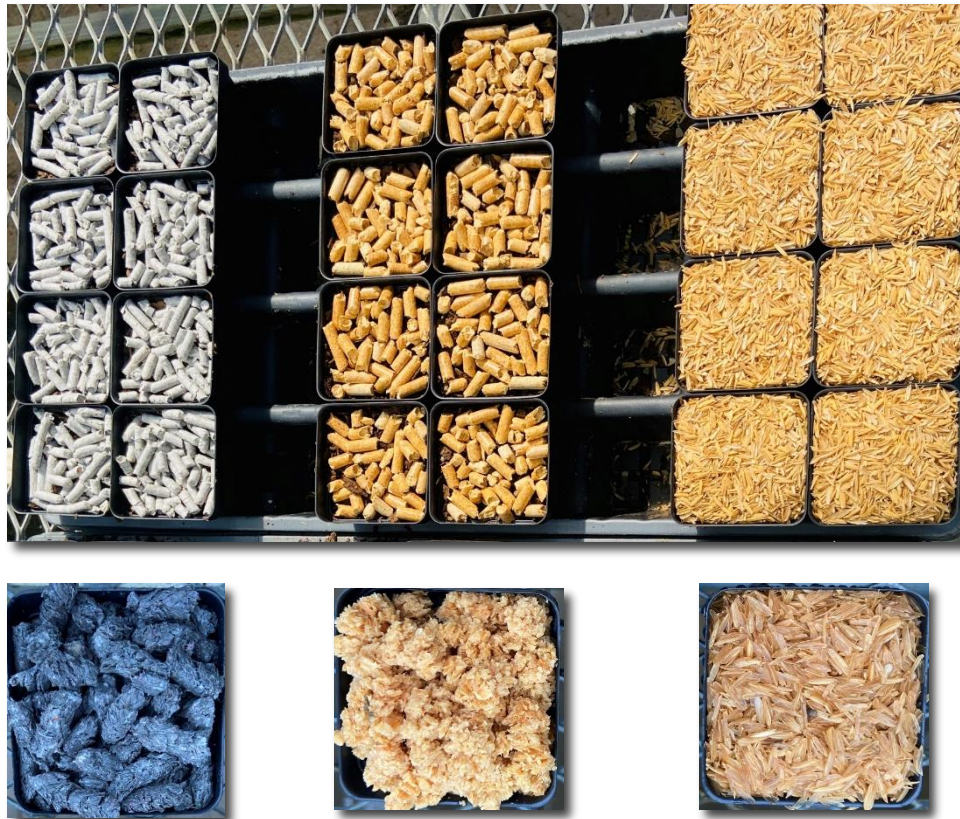
Figure 2. Paper pellet, pine pellet, and rice hull mulches (left to right) when applied dry (top) then saturated with irrigation (bottom).

and provided excellent weed control at 0.5-inch depth. Growers should conduct small trials with individual products and crop species prior to large scale adoption.